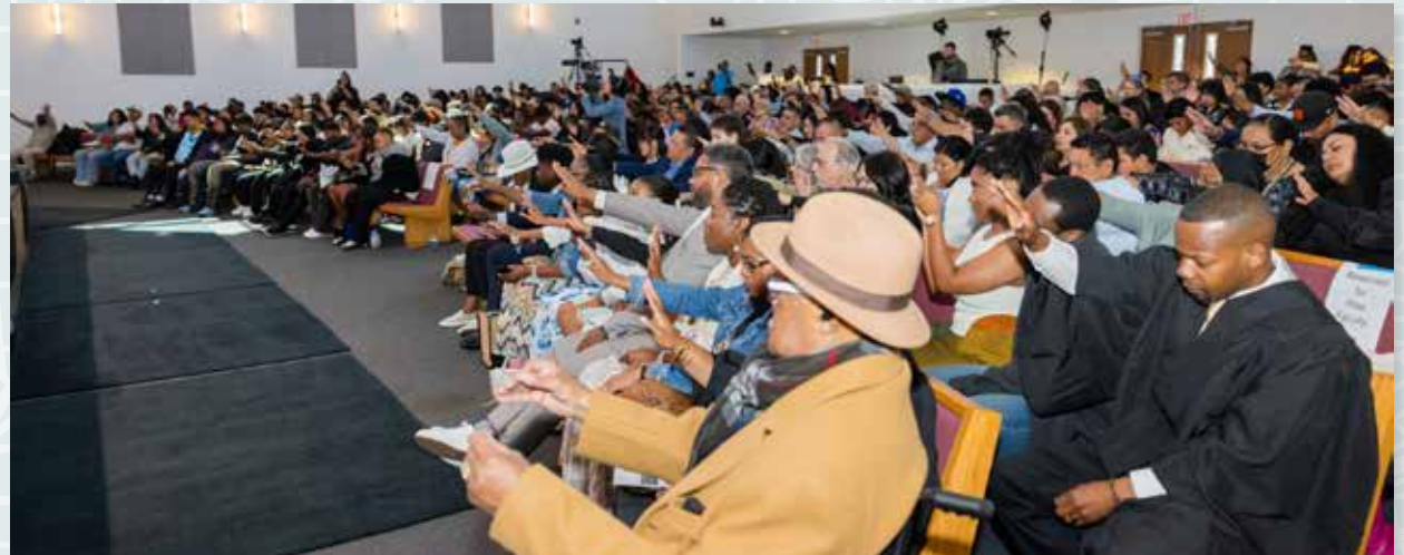
Prayer during graduation

The real good news, the Gospel, is not some feeble recipe for "success." Students at Rise Prep eagerly study and sing the story the Lord tells them though His people: Christ is King and they are his blessed children, called to good work!