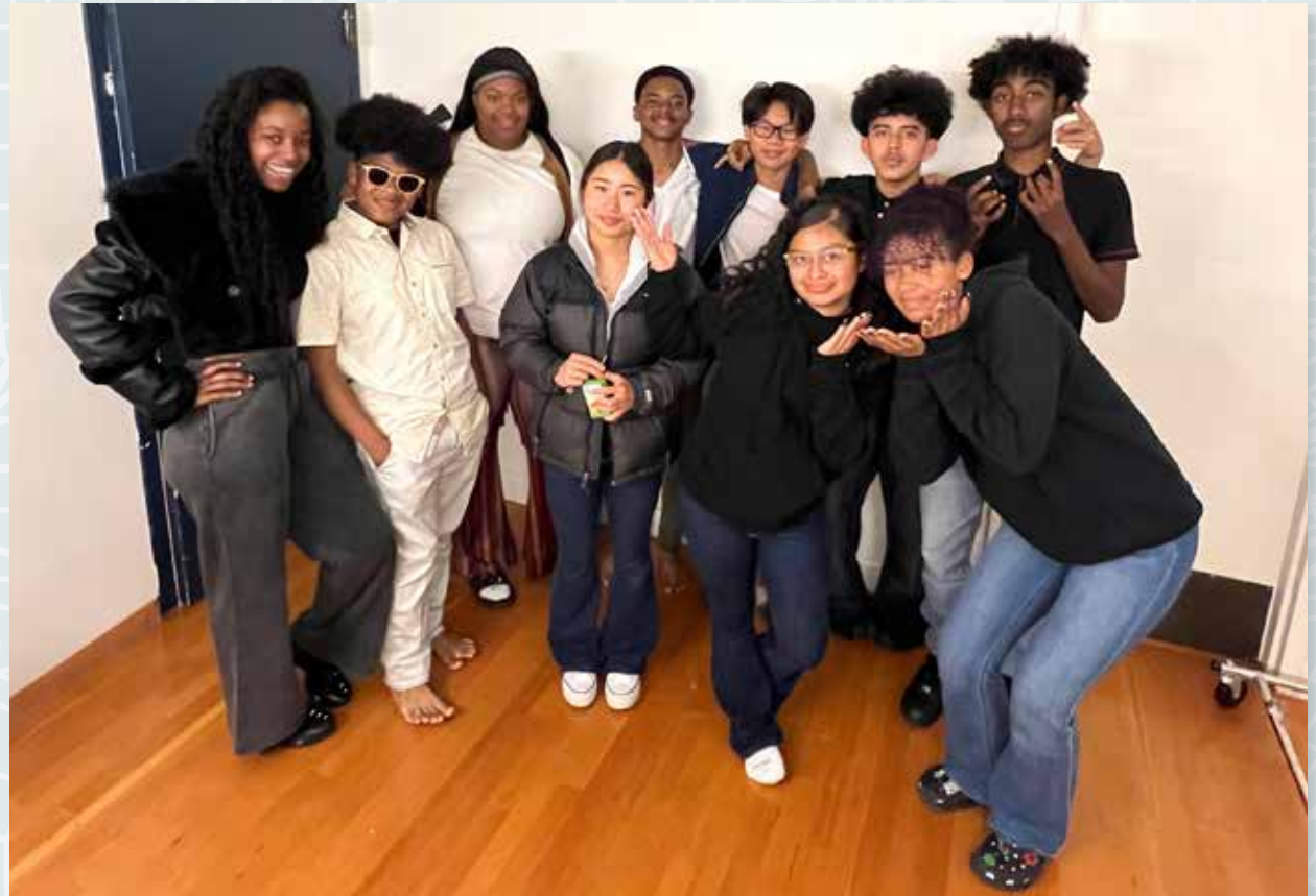
Dance class at Zaccho Dance Theatre